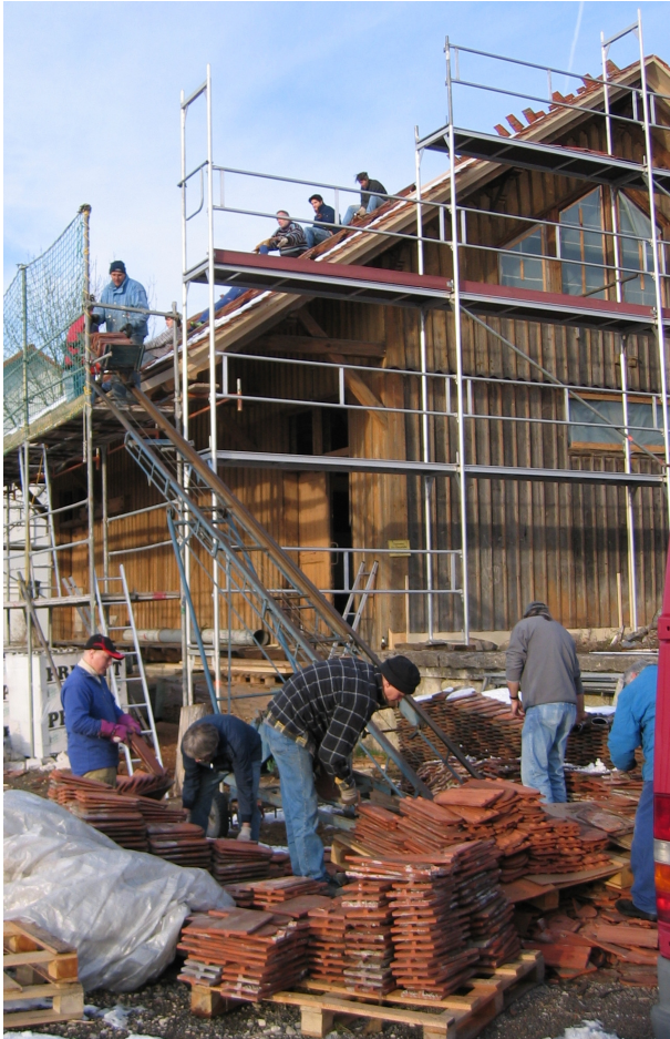
making of Kulturgüter-Schuppen :